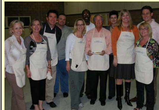
Corporate Board Members spent the Tuesday prior to Thanksgiving serving meals to more than 500 people who attended the Grant Woods- Mesa Branch's Thanksgiving Dinner.